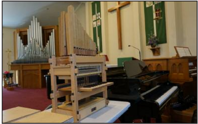
The Orgelkids Kit organ assembled in Advent Lutheran church - a wonderful education tool for music, math, physics and more!

Finally, we recently took delivery on our Orgelkids kit. Since we cannot take it to the schools (yet), we intend to use it during our online worship.